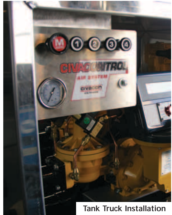
Tank Truck Installation